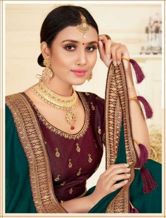
EXPERIENCE SHEER CLASS THIS SEASON WITH LATEST COLLECTION, FABULOUS COLORED SUIT IN BRILLIANT SHADES OF GREEN