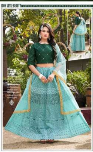
LOOK STYLE BEAUTY