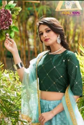
TIPS & TOPS