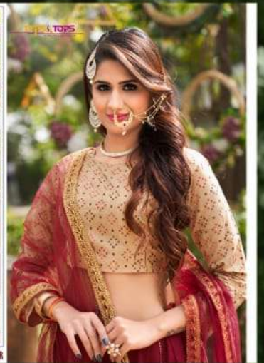
TIPS & TOPS