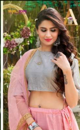
TIPS & TOPS