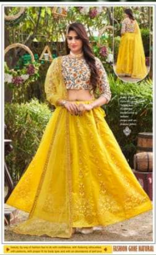
FASHION GONE NATURAL