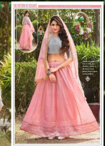
THE PATRONS OF DISCRETION