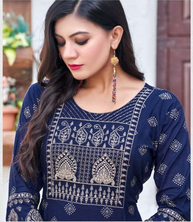
Traditional looks rule the season with a hint of modern-chic!