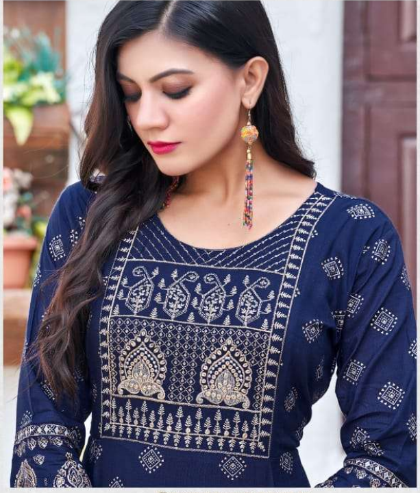
Traditional looks rule the season with a hint of modern-chic!