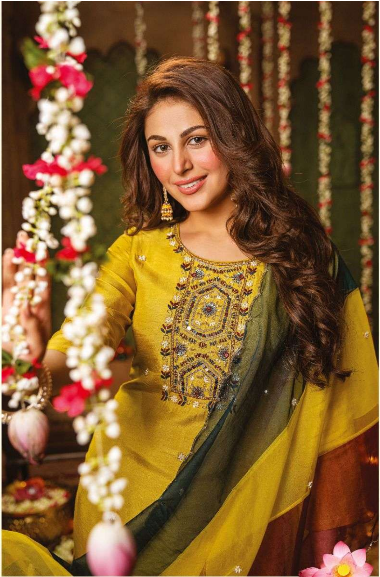
• Anything possible with a little lipstick and champagne