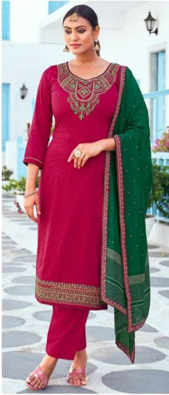
• 01031 •