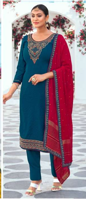
• 01033 •