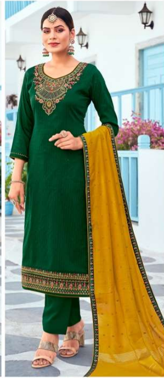
• 01032 •