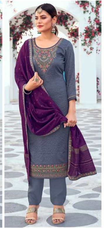
• 01034 •