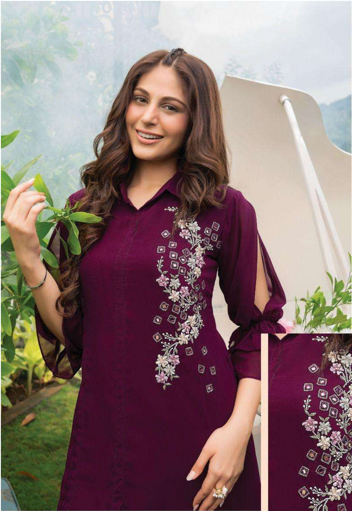
fashion can be bought style ;