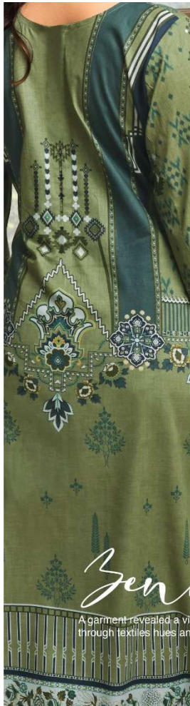
A garment revealed a vibrant mix of culture through textiles hues and silhouette.