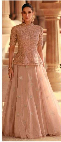
CODE - 5393