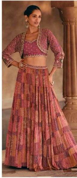
CODE - 5392