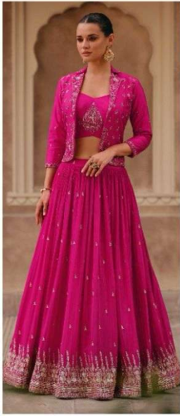
CODE - 5391