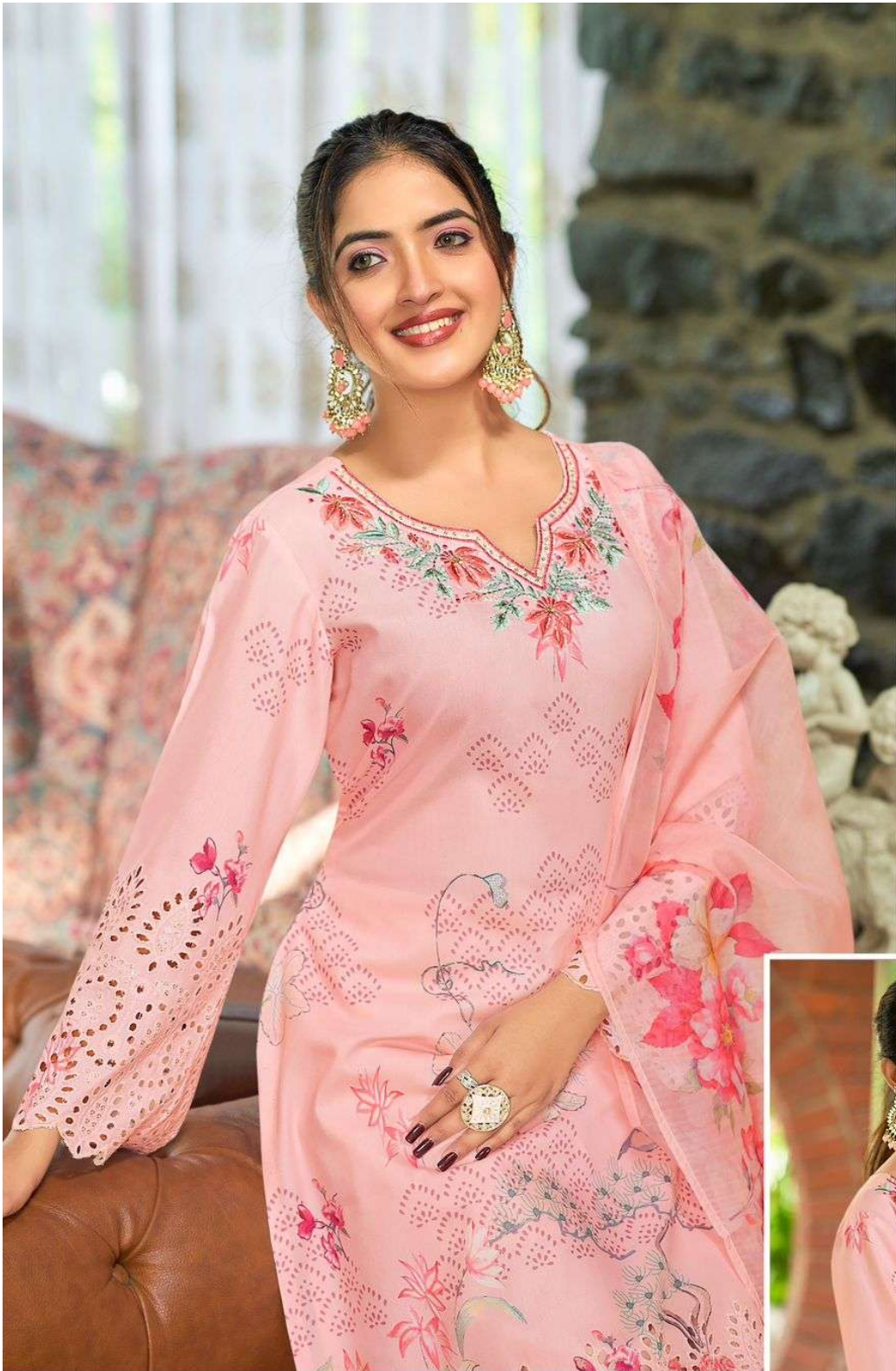
Express your great sense of style in the most unique design and flawless detailing.