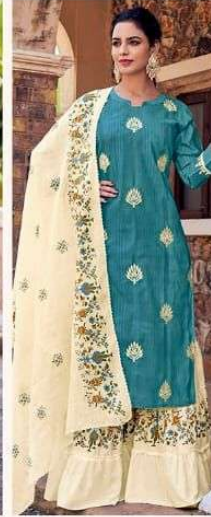
CODE | 3496