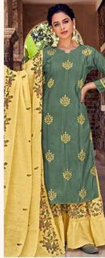
CODE | 3494