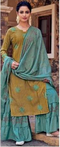
CODE | 3491