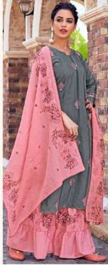
CODE | 3493