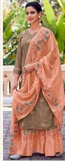
CODE | 3495