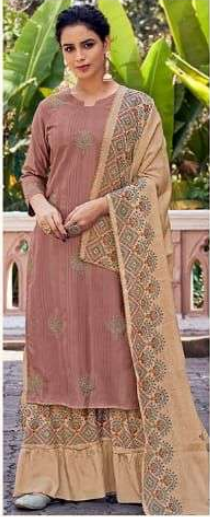
CODE | 3492