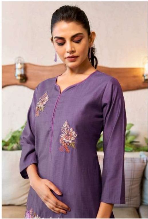
Knowledge design can create keeping in mind the trends, fabrics and colors of the season by fashion designers and manufacturers of Indian garments.