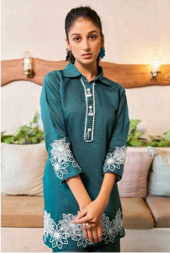
Seasonal designs are created keeping in mind the trends, fabrics and colors of the season by fashion designers and manufacturers of Indian garments.